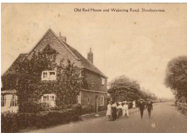
The Red House early 1900s