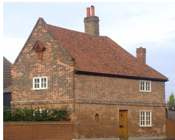
The Red House 2010

Did you know that we have twelve Grade II listed buildings in Shoeburyness? Unless they are pointed out to you, it's very easy to overlook them as you pass by.