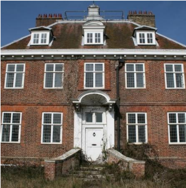
Suttons Manor House